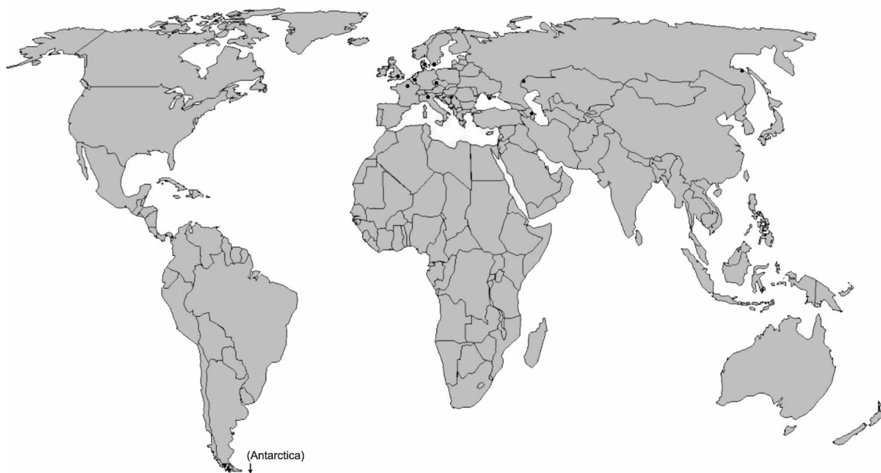
FIGURE 1. Geographic distribution (solid black dots) of members of the genus Pycnolepas ; note the disjunct occurrences of early(?) Aptian and middle Albian species in Antarctica and in the Russian Far East, respectively. Dots for southern Sweden and Belgium/the Netherlands in fact represent more than one species, namely P. ignabergensis + P. bruennichi , and P. bruennichi , P. landenica + P. industriosa , respectively. Pycnolepas orientalis , from an unspecified Upper Cretaceous level in Azerbaijan, is here considered a nomen dubium (see text); P. nov. sp. from the upper Paleocene of Kazakhstan has not yet been described or illustrated.

species. This interpretation finds support in the fact that amongst associated macrofossil taxa some show European links, e.g. the inoceramid bivalve Inoceramus ex gr. anglicus Woods, 1911 and the buchiid bivalve Aucellina cf. aptiensis d'Orbigny, 1850, plus the ammonoids Beudanticeras sp., Sonneratia? sp., Cleoniceras sp. and Eogaudryceras ( Eotetragonites ) duvalianus (d'Orbigny, 1840). In the absence of other capitular valves and imbricating plates, we refer to the present material as P. aff. rigida for the time being.